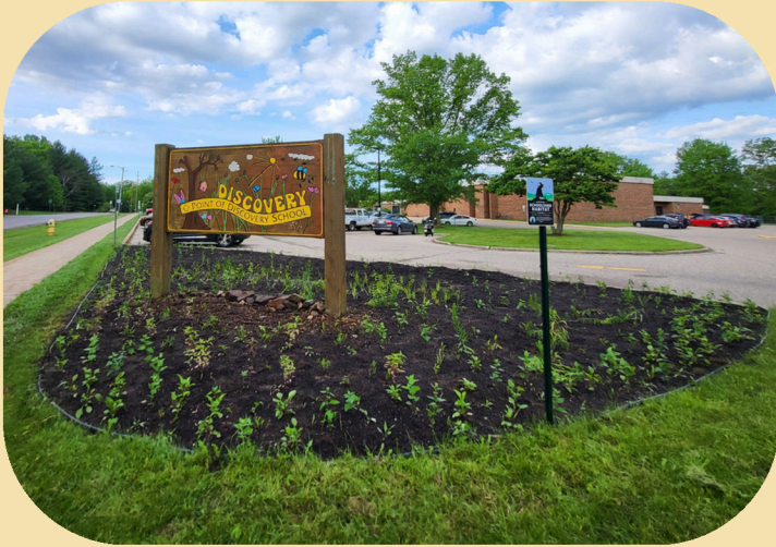
Point of Discovery School's Rain Garden Installed May 16th, 2024

RC serves as the Wisconsin Green & Healthy Schools' Focus Area Contact for Waste Management & Recycling. This year they installed two school gardens at Point of Discovery School & McKinley Elementary. These gardens are part of a 3-year program, funded by the City of Stevens Point Public Utilities to install rain or prairie gardens at local schools. This year, 1,200 native plants were planted at schools.