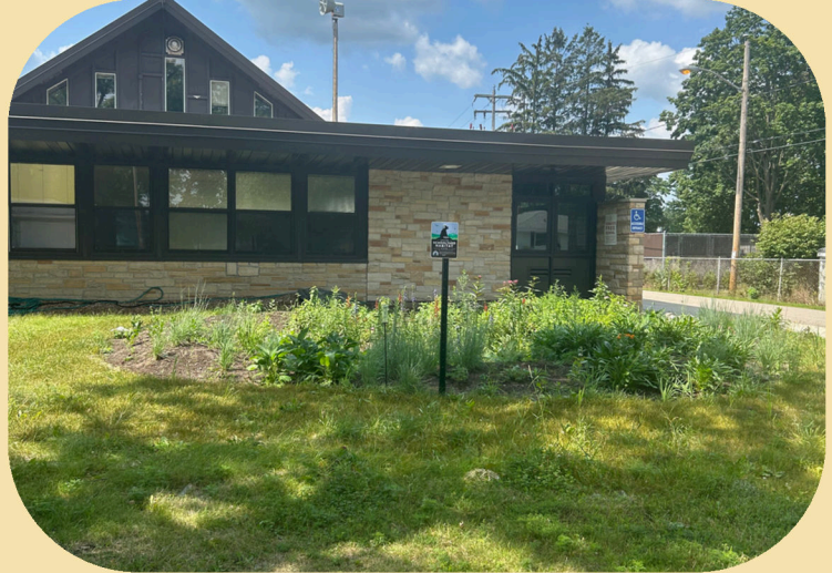
McKinley Elementary's Rain Garden Installed May 23rd, 2024