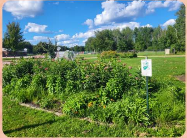
Madison Elementary's Rain Garden Installed June 24th, 2025