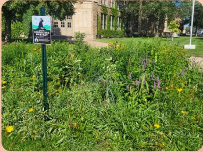
PJ Jacobs School's Rain Garden Installed May 28th, 2025

RC serves as the Wisconsin Green & Healthy Schools' Focus Area Contact for Waste Management & Recycling. This year they installed two school gardens at PJ Jacobs Middle School & Madison Elementary. These gardens are part of a 3-year program, funded by the City of Stevens Point Public Utilities to install rain or prairie gardens at local schools. This year, 1,200 native plants were planted at schools.